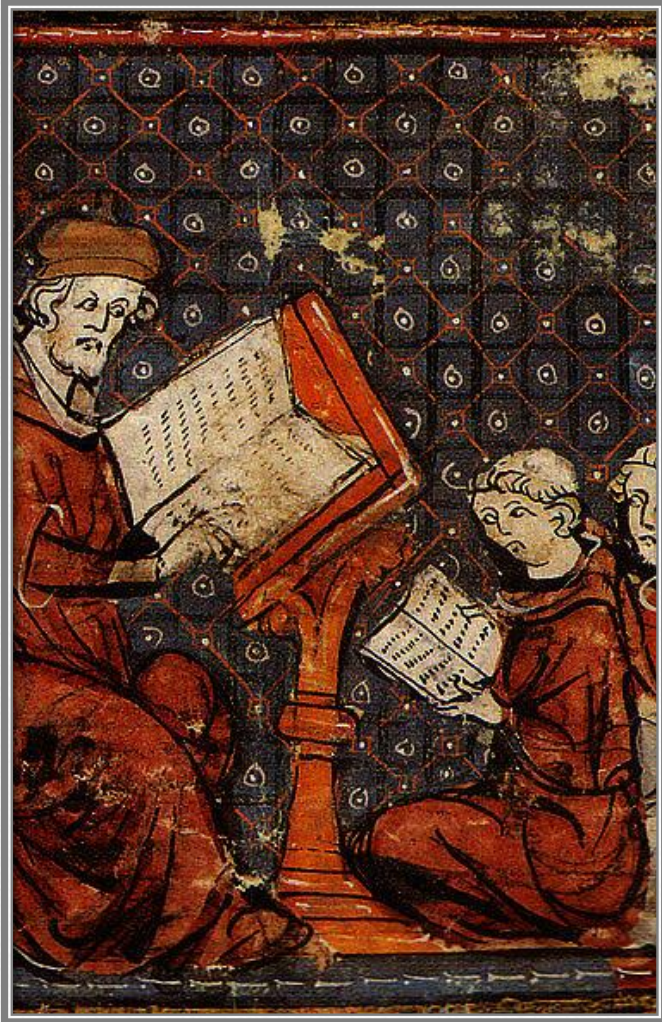
Faith Formation circa 1325